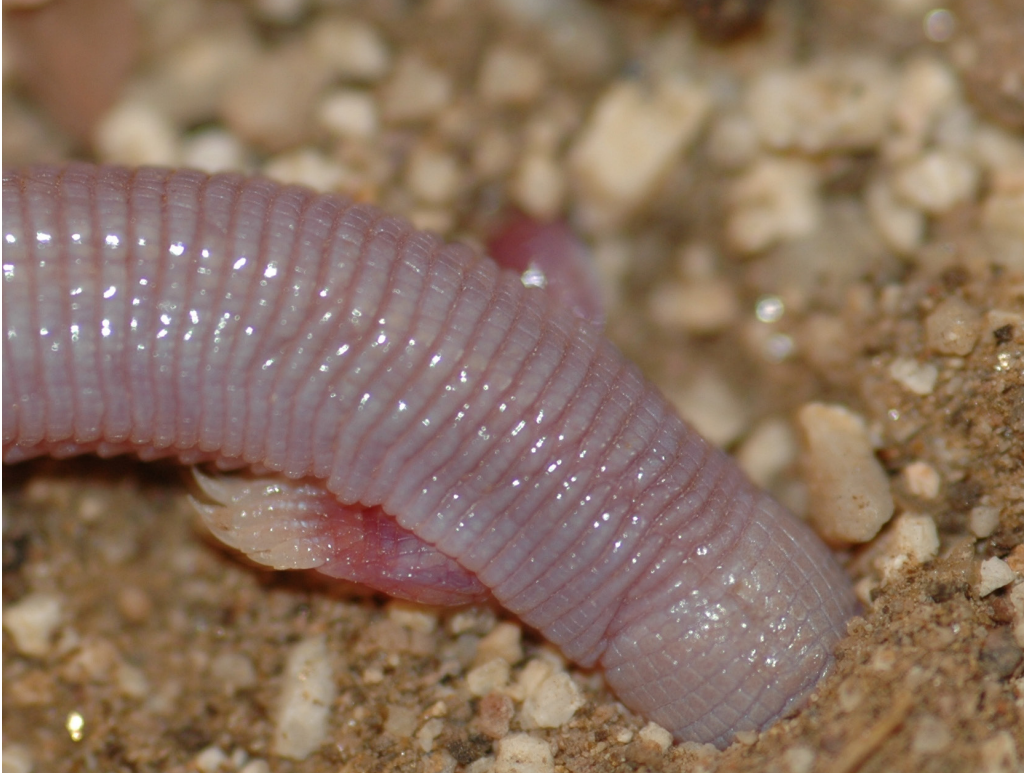
FIGURE 3. Adult Bipes bipes collected on 22 November 2015 from Rancho Los Quijotes, 4.4 km SE San Juan de los Planes, Municipality of La Paz, Baja California Sur, México. During initial soil penetration in early stage burrowing, the limbs are typically pressed against the sides of the body by which the anterior body may assume a more vertical position (Gans 1974; personal observations).

Color of the head, body, and tail in adults is typically pink. Some individuals are white on the ventral surface. Juveniles are usually pale pink.