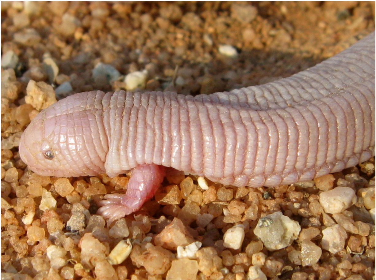
FIGURE 1. Adult Bipes biporus observed on a sidewalk at 2200 h on 5 June 2011 in the City of La Paz, Municipality of La Paz, Baja California Sur, México. This species is primarily fossorial; this is one of those rare occurrences observed above ground (see Comments ).

Euchirotos diporus : Cope 1896a:313 and Cope 1896b:1012. Lapsus .