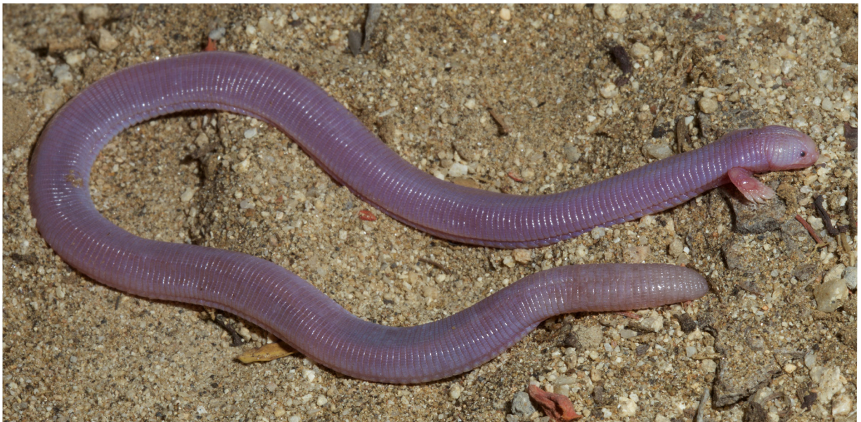
FIGURE 2. A juvenile Bipes biporus (178 mm SVL) from Rancho Los Quijotes, 4.4 km SE San Juan de los Planes, Municipality of La Paz, Baja California Sur, México.

arated by a pair of nasals. Postmental scale is greatly enlarged and rectangular in shape and in contact with the mental and two sublabials and a single infralabial. There are four infralabials and four supralabials. The eye is small with a round pupil. Posterior head scales (ocular scales) are small and square to rectangular-shaped. Unlike other squamates, the dorsal and ventral scales along the entire length of the body are arranged in annuli (rings) with 242–261 dorsal annuli, 143–167 ventral annuli, 2–6 lateral annuli, 2–13 intercalated quarter annuli (present dorsally and ventrally), and 24–31 caudal annuli on non-autotomized tails. Dorsal midbody annulus segments range from 27–32 and ventral midbody annulus segments from 24–30. Six preanal scales are present in a single transverse row with the median pair greatly enlarged. A scale with one preanal pore is located on each side of the transverse row. The tail is blunt and short, 9.5–10.5 percent SVL. External sexual dimorphism is absent in Bipes biporus (Grismer 2002; Papenfuss 1982; Smith and Smith 1977).