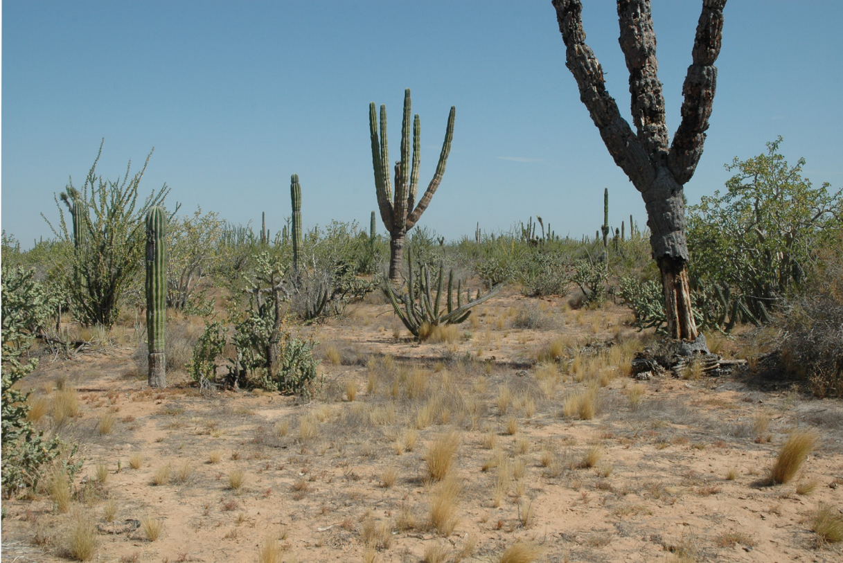
FIGURE 4. Habitat of Bipes biporus approximately 35 km west of San Ignacio, Vizcaíno Desert Biosphere Reserve, Baja California Sur, México. Typical habitat is xerophilic scrub vegetation and unconsolidated, fine-grained soil. Photograph by Clark R. Mahrtdt, July 2015.

lateral, and ventral views of the skull and a lateral view of the mandible), Guibé (1970: osteology of cloacal region), Kearney (2002) and Kley and Kearney (2007: ventral view and right lateral view of the pelvic girdle), K. Smith (2009: left dentary), Vanzolini (1951a: dorsal, ventral, lateral views of the skull and lateral and lingual views of the mandible), Wever (1978) and Wever and Gans (1972: middle ear), Wu et al. (1993, 1996: ventral and lateral views of the skull), and Zangerl (1945: sternum, pectoral girdle, and forelimb). Black-and-white line drawings of external morphology were presented by Cope (1894, 1900), Smith (1946, 1949a, 1965, 1971), Sanborn and Loomis (1976: anterior dorsolateral view of the head and body), and Smith and Smith (1977: dorsal, ventral, and pectoral views of the body, lateral view of the head, annuli at midbody, and a ventral view of the tail). Line drawings showing the for-