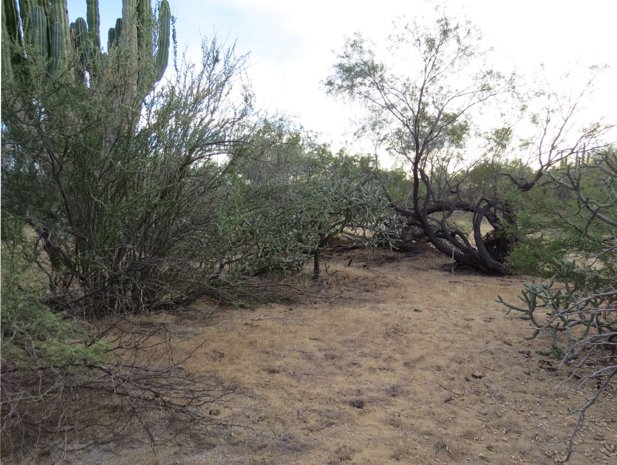
FIGURE 6. Natural habitat of Bipes biporus from Rancho Los Quijotes (33 m elev.) near San Juan de los Planes, Municipality of La Paz, Baja California Sur, México. Photo by Clark R. Mahrtdt, November 2015.

emerging from a burrow was published by Alaníz-García (2011). Color photographs of Bipes biporus feeding on a caterpillar, in simulated burrow, and in a defensive posture were presented by Franklin (2014). Black-and-white images of electron micrographs were provided by Gundy (1977; three images of the normal eye, photoreceptor cells, and retina, and two images of degenerating retina and photoreceptor cells) and Rhoten (1970; pancreatic cell types); black-and-white radiographs were published by Bogert (1964; whole-body radiograph), Kearney (2002; pectoral girdle and forelimbs), and Wever and Gans (1972; photomicrograph of a transverse section of the ear). Photographs of the habitat were published by Franklin (2001, 2014), Grismer (1994c, 2002), Grismer et al. (1994), Langner (2019), Leviton and Banta