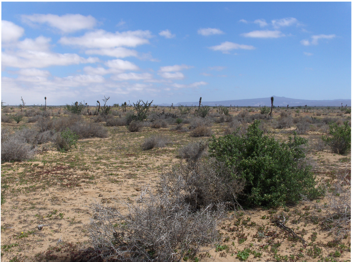
FIGURE 5. Natural habitat of Bipes biporus 2.5 km E of Villa Jesús María, Baja California, Municipality of Ensenada, Valle de los Cirios Protected Area in the northern Vizcaíno Desert region with sparse vegetation and generally fine-grained soil.